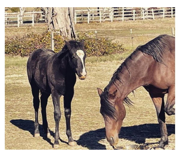
La Mar Isa at 5 months with mom Bella Isa

On June 28, 2022 Blue Oaks Center was excited to announce the birth of La Mar Isa (BC Bella Isa x BC El Sevillano). She is the first 87.5% Baca Barb to be born under our breed-up program which is part of the plan to save this strain. In the near future, Bella Isa will be bred to Legado (Coloradita x El Savache) a 100% Baca, to carry on the Pure Bred Baca Preservation. BOC continues to be extremely proud of our foundation and 2<sup>nd</sup> generation Endangered Breeding Program.