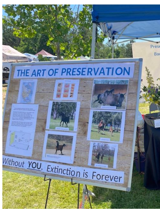
Art of Preservation