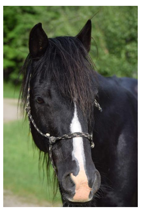
Adelantado, our inspiration

Keep up to date on our travels and promotion of the Baca horses by visiting our website <a href="https://www.centerforamericasfirsthorse.org">www.centerforamericasfirsthorse.org</a> and on Facebook - Center for America's First Horse.